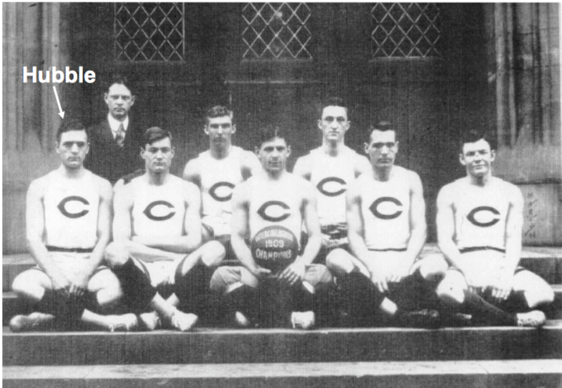
University of Chicago 1909 National Champions